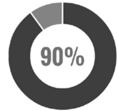
Average Success Rate